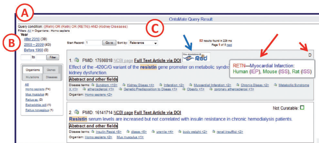
Figure 3. OntoMate query results page. (A) ‘Query Condition’ displays the string of objects and terms used in the query. (B) The filter section allows users to adjust the results according to publication chronology or object/term refinements. The tabs display hyperlinked subsets of result categories. Any link may be selected to restrict or expand the selected results. A ‘filter path’ appears below the Query Condition to show the user what filters have been applied. (C) The search results are sorted by relevance by default, but can also be sorted by publication date or PMID. If the reference is in RGD already, an RGD logo appears (blue arrow) above the title. If there are any GO or disease vocabulary annotations from this reference, an aspect initial appears in the upper right corner of the reference entry, D = disease. By ‘mousing over’ the aspect letter, a pop-up appears to show what annotation(s) has been made (long red arrow).

These searches involved a single gene for the recent Renal Disease Portal curation at RGD. The OntoMate search is based on RGD gene IDs and ontology term IDs.