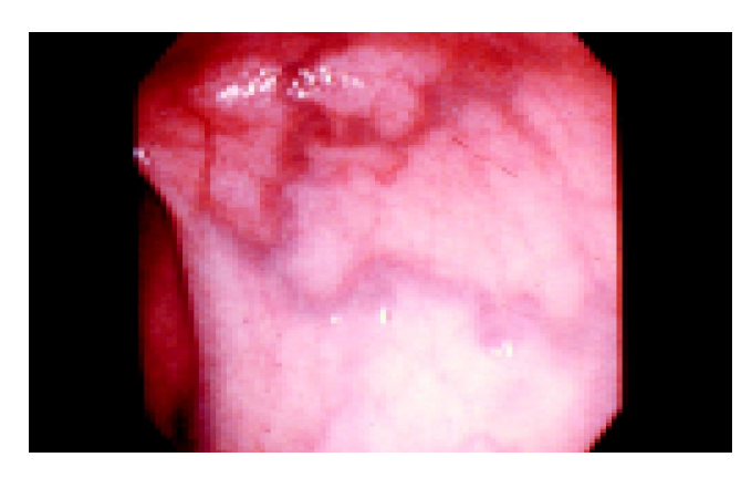
Figure 2 Colonoscopic examination shows a blue vein.