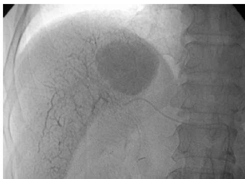
Figure 1 Post-embolization radiographic image of upper abdomen shows homogeneously packed HCC and retrograde filling of multiple parenchymal portal veins.

According to the findings on triphasic CT, the HCCs of