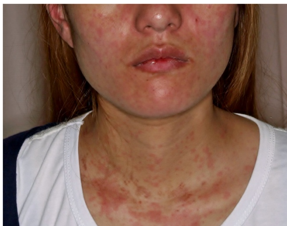
Figure 1 Picture of the patient showing salmon-colored rash on her face and trunk.

days, without improvement. The patient did not have allergies, a past medical history, alcoholism, herbal treatment, insect bites, or contact with any animal. She did not travel to any foreign country for the past two years.