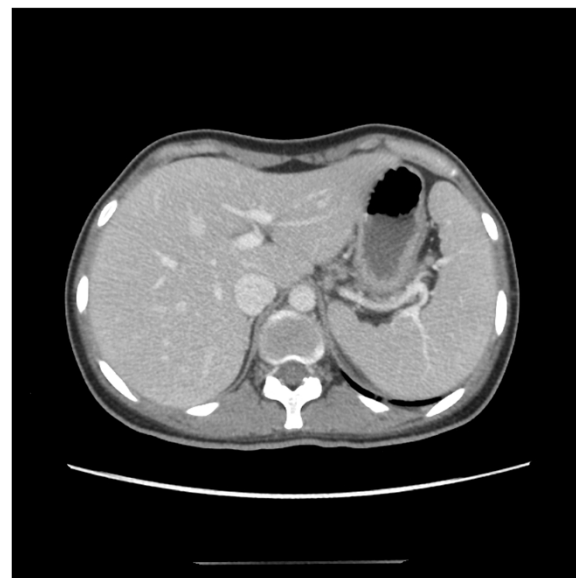
Figure 2 Computed tomography images showing splenomegaly.

The combination of nafamostat mesilate and prednisolone therapies caused immediate improvement of both the fever and rash. The inflammatory markers decreased immediately, and DIC improved. On day 34, the dosage of oral prednisolone was decreased from 30 mg/day to 25 mg/day, and the patient was discharged. Her symptoms