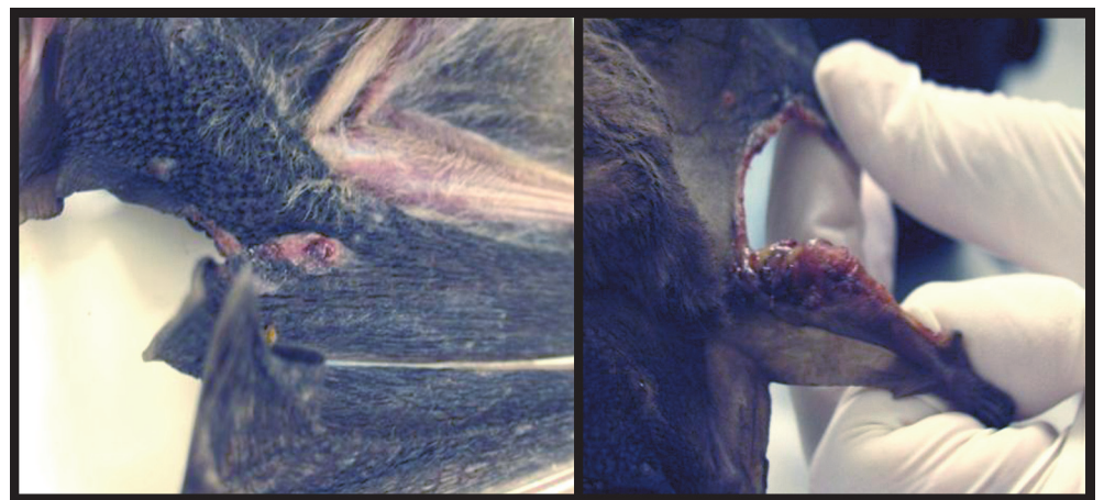
Figure 2. Dermal lesions in bats suggestive of Leishmania infection. A. lituratus found dead in Tabasco, Mexico, showing dermal lesions on the edge of the wing membrane, suggestive of a Leishmania infection.

The permissiveness of bats to harbor Leishmania (L.) mexicana was shown in two T. brasiliensis individuals, which were artificially infected in captivity with 1 \times 10^6 Leishmania (L.) mexicana promastigotes. No visible damage was observed in the tissues, yet promastigotes were recovered from heart and liver tissue fragments of these infected bats and cultured in