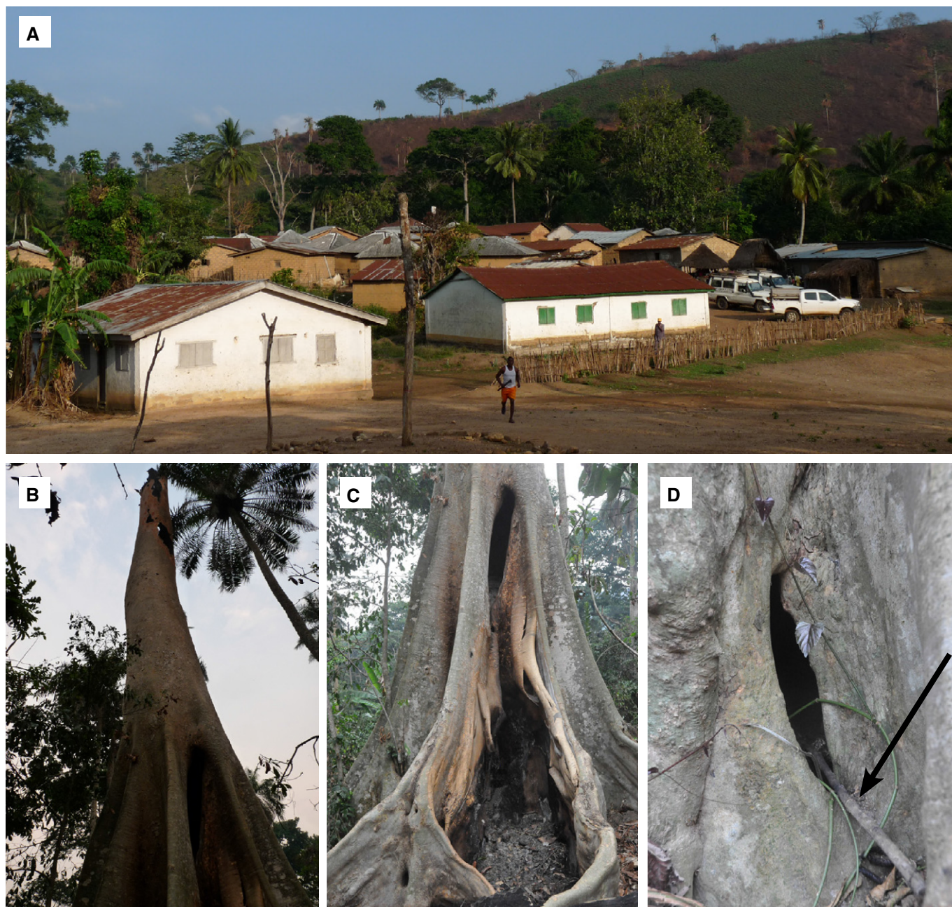
Figure 3. Meliandou and the burnt tree that housed a bat colony.