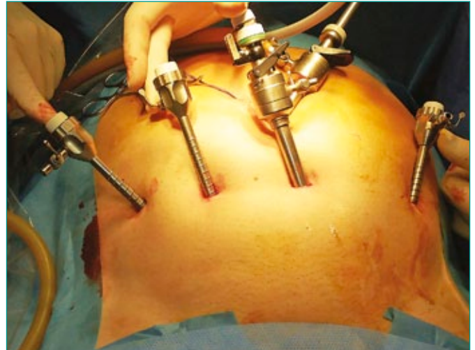
Figure 1. Location of the ports during extraperitoneal laparoscopic adenectomy.