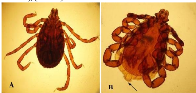
Fig. 1. A) Female of R. turanicus tick. B) Male R. turanicus , broad caudal appendage (Arrow), (25×).

A total number of 241 ticks (127 males and 114 females) were collected from hedgehogs. There were no differences in male and female ticks ( p > 0.05 ). Out of hedgehogs, 23 were infested with ticks (67.70%). All ticks were belonged to R. turanicus species (Fig. 1). Percentage of fed ticks on the body of hedgehogs was 72.20% (67 females and 107 males). Fleas of the species A. erinacei were found on 19 hedgehog of 34 (55.90%) examined hedgehog (Fig. 2). The number of infested fleas was 148 (42 males and 106 females), (Table1).