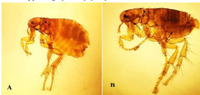
Fig. 2. A) Female hedgehog flea; A. erinacei , genal and pronotal ctenidia (Arrow). B) Male A. erinacei , genal and pronotal ctenidia and aedeagus organ (Arrow), (40×).