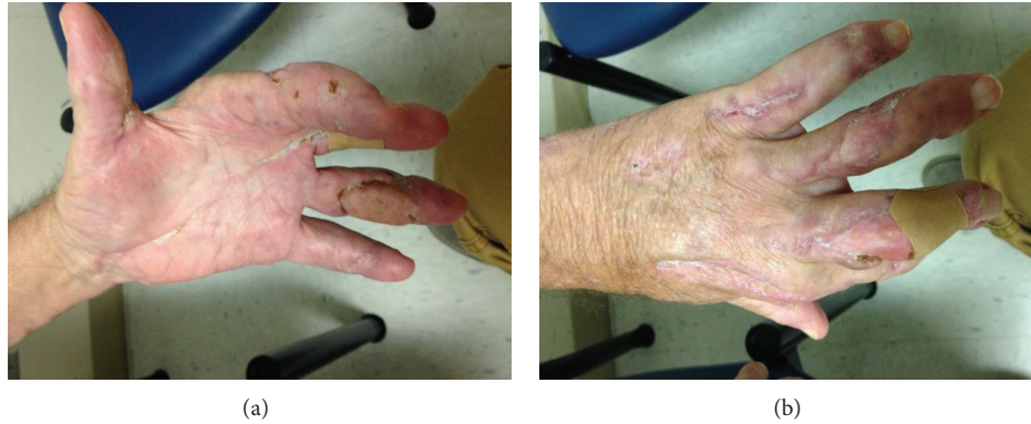
FIGURE 3: Patient's left hand at his 9-month follow-up.