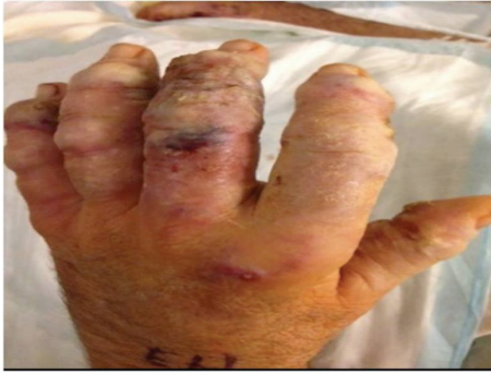
FIGURE 1: Inflammatory nodules on the left hand on second admission.