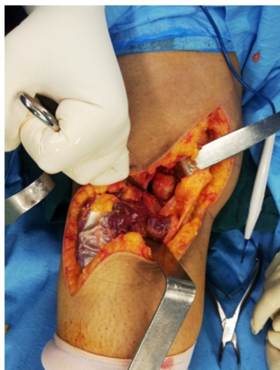
Fig. 2. Posterior transverse capsulotomy

heads of gastrochenemious were detached and posterior transverse capsulotomy was performed (Fig. 2). After complete excision of the tumor body, capsule was repaired and both heads of the gastrochenemious were reattached to their remnants. Then patients underwent aggressive physiotherapy for regaining range of motion using a continuous passive motion (CPM) machine. After achieving the complete range of motion, the second staged anterior approach was performed with standard anteromedial knee arthrotomy. This method seems to be effective because all patients regained complete range of motion in a few days and no patient needed further knee manipulation. Also, KSS score was increased significantly in these patients. It seems that for