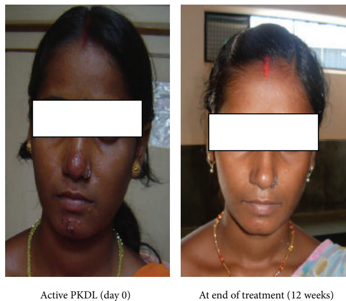
FIGURE 4: Case 3: patient with nodular lesions.

were used [6]. If there was toxicity of grade 3 and above, the treatment was discontinued and the subject was removed from the study and offered rescue treatment. Nephrotoxicity was defined as an increase in serum creatinine that was either double the baseline levels or more than 2.0 mg per deciliter ( 177 \mu\text{mol} per liter).