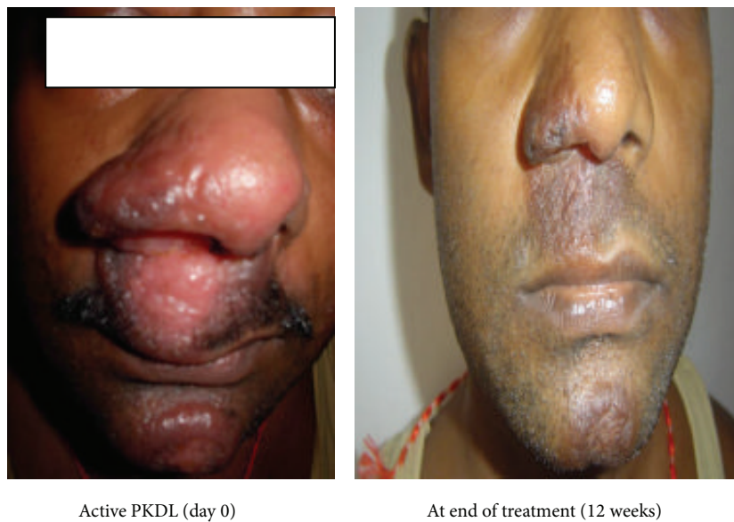
FIGURE 2: Case 1: patient with nodular lesions.

parasite and culture positivity in diagnosis of PKDL we did only polymerase chain reaction (PCR) for making the diagnosis [4]. DNA isolation was done by resuspending the slit-skin sample in 200 \mu L phosphate-buffered saline (PBS) and using QIAamp Blood DNA Mini Kit (Qiagen) according to the manufacturer's instructions. Parasite detection by PCR was done by using L. donovani species specific primers and methodology was followed as described elsewhere [5]. PCR and k39 positive confirmed cases were only included in the study. However for followup and treatment efficacy only clinical parameters were used.