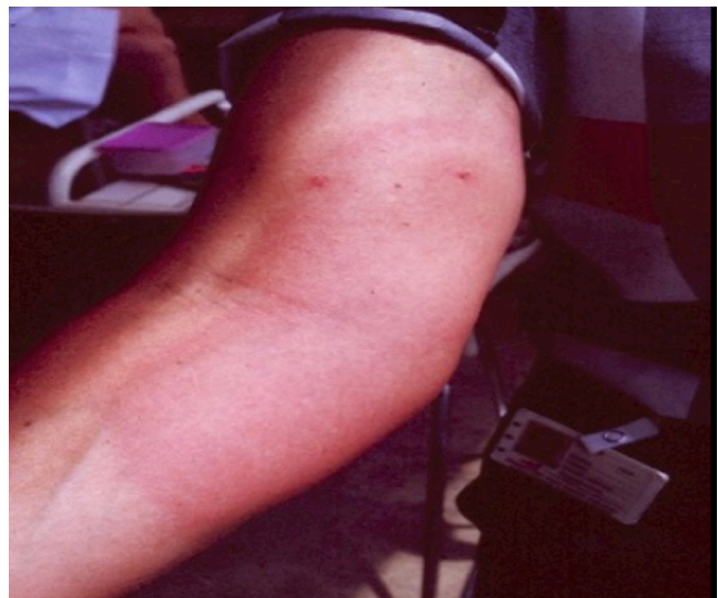
Fig. 1. Confluent large local reactions to 2 tick bites ( Ixodes holocyclus ). Adapted with permission of Stephen L. Doggett, Senior Hospital Scientist, Pathology West, ICPMR (level 3), Westmead Hospital, Locked Bag 9001, Westmead NSW 2145, Australia.

Large local reactions to tick bites are most effectively treated by immobilisation of the affected area and elevation of the part above the heart (if possible) to aid resolution of the intense oedema, application of ice, administration of antihistamines daily with commencement as soon as possible after the tick bite and often administration of oral corticosteroids to suppress the inflammation, taken immediately when previous large local reactions to tick bites have occurred. Because these reactions are caused by a bite, that is, a puncture wound, and the tissues are grossly swollen, antibiotics are often given, particularly where the large local reaction has occurred in an area of the body where infection is more likely to occur e.g., around the buttocks