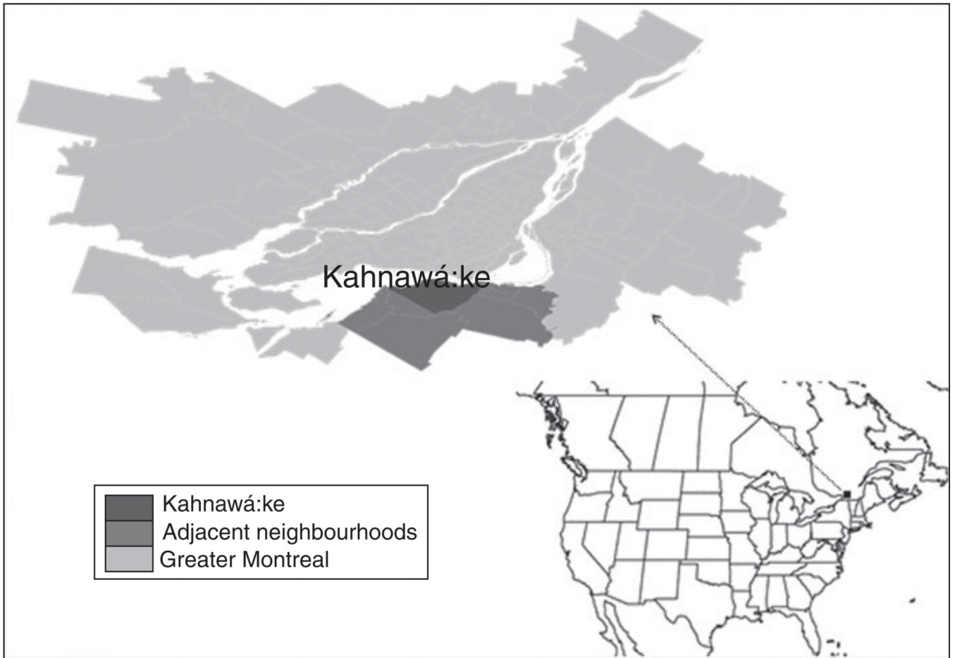
Fig. 1. Map of Greater Montreal Region showing Kahnawá:ke and adjacent neighbourhoods.