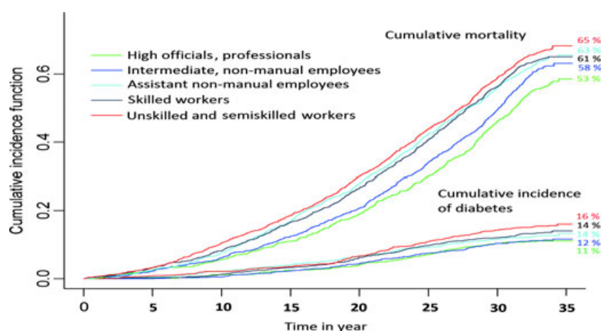
FIGURE 1 Cumulative incidence curves of diabetes and mortality across the occupational classes.

*Adjusted for age, BMI, hypertension, smoking, physical activity and self-perceived psychological stress. SHR, subdistribution hazard ratio.