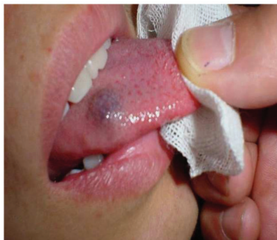
Figure 1. Tongue hemangioma prior to treatment.

Characteristic features of a tongue hemangioma. A tongue hemangioma is demonstrated in Fig. 1. The following characteristics of a tongue hemangioma were observed: Raised mass, purple and soft on palpation. Fig. 2 shows the local pathological changes that occurred one week after an injection of pure alcohol. The local structure was no longer protruding, the mucosal color had returned to normal, the tongue was freely moveable without dysfunction, and the patient's voice was unchanged. Fig. 3 demonstrates the local pathological changes that were observed by optical microscopy one week after the injection of pure alcohol. The injection of pure alcohol led to the formation of a thrombus-like structure within the lumen of the hemangioma. Certain regions of the lumen of the hemangioma were blocked completely, whereas other regions were only partially blocked. Such structural characteristics of the lumen ensure a local blood supply and avoid the local formation of necrotic tissue. These factors elucidate the reason that pure alcohol is successful in the treatment of hemangiomas.