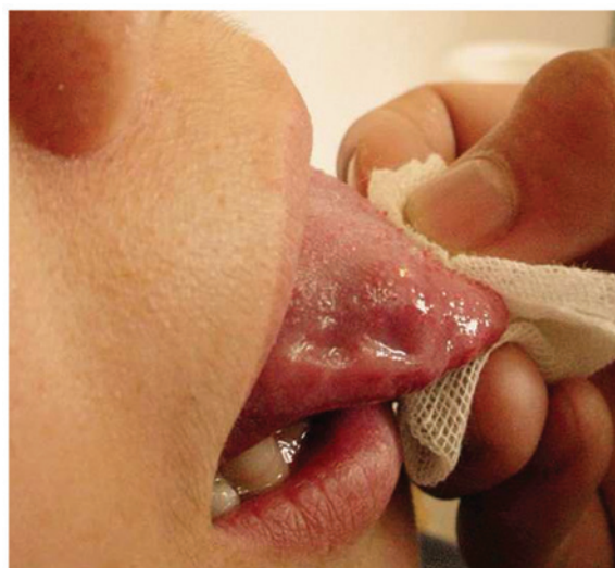
Figure 2. Tongue hemangioma one week following treatment.

Comparison of serum VEGF levels. The serum VEGF levels of the 10 patients with hemangioma were significantly higher when compared with those of the healthy group ( P < 0.01 ). The serum VEGF levels of the 10 hemangioma patients one week