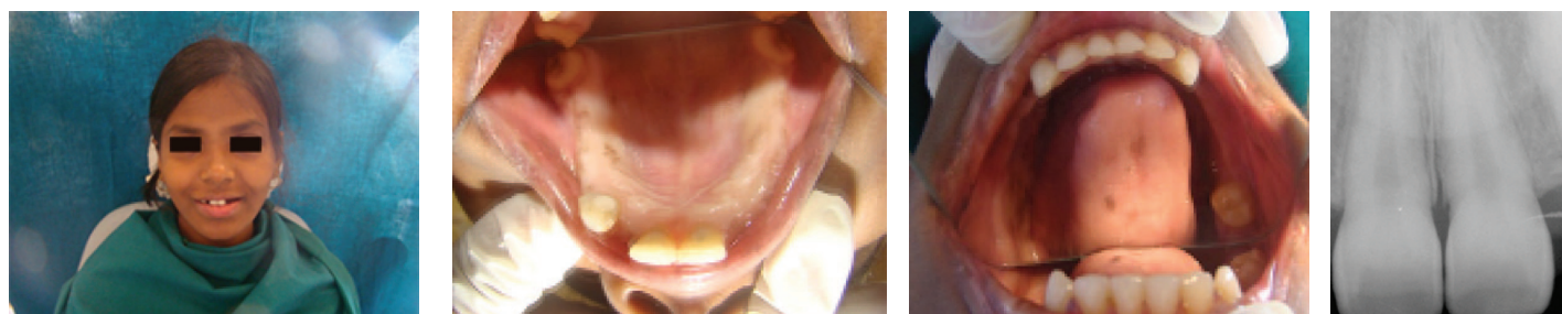
[Table/Fig-1]: Pre-treatment extra-oral view [Table/Fig-2]: Pre-treatment intraoral view of maxillary arch [Table/Fig-3]: Pre-treatment intraoral view of mandibular arch [Table/Fig-4]: Intraoral periapical radiograph of maxillary central incisors showing enlarged pulp chambers

The treatment planning for prosthetic rehabilitation for this patient was made after considering the age of the patient, multiple missing teeth and long standing partial edentulism. For the purpose of improved aesthetics and elevated psychological acceptance of the prosthesis by the patient, precision attachment retained interim removable partial denture was planned in the maxillary arch [5]. Due to poor periodontal condition of lower anterior teeth, a conventional clasp retained interim removable partial denture was planned for the mandibular arch [6]. The enlarged pulp chambers of the anterior teeth carried a risk of perforation during tooth preparation and hence 21, 11, 13 were root canal treated. Primary impressions of the upper and lower arch were made. Casts were prepared with type III dental stone. Temporary baseplates and wax occlusal rims were fabricated and a tentative jaw relation was carried out to confirm that adequate inter-arch space was available for fabrication of precision attachment retained prosthesis. Tooth preparation for porcelain fused to metal bridge was done on 21, 11, and 13 [Table/