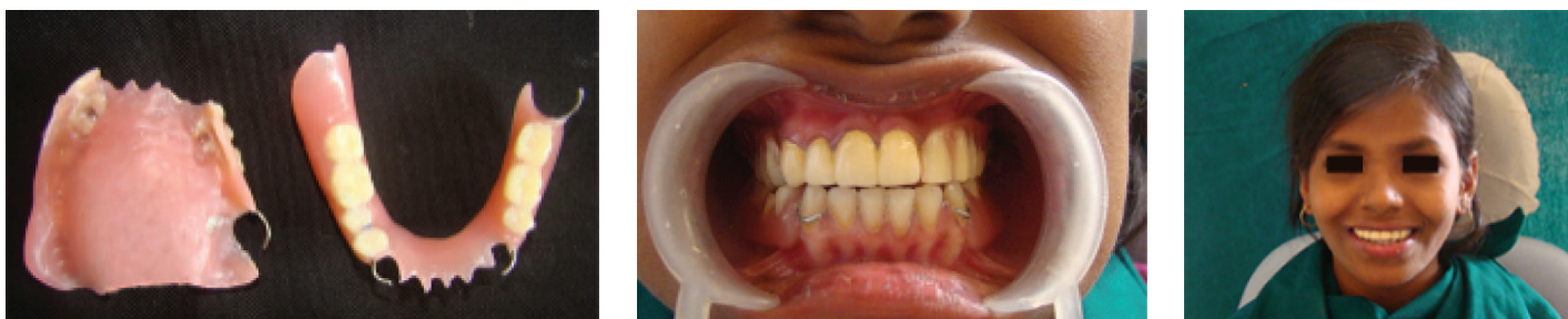
[Table/Fig-9]: O-ring incorporated upper partial denture and lower conventional removable partial denture, [Table/Fig-10]: Post insertion Intra-oral view, [Table/Fig-11]: Post insertion Extra-oral view

Fig-5]. Anatomic impression of the upper arch was made in putty elastomeric impression material and light body. Anatomic cast was prepared in type 4 dental stone. Porcelain fused to metal bridge was fabricated on this anatomic cast on the prepared abutments of 11, 13 and 21 [Table/Fig-6]. The extra coronal precision attachment that is the O-ring posts (male matrix) were incorporated distal to 13 and 21 in the porcelain fused to metal bridge [Table/Fig-7]. Following trial, finishing and polishing, this porcelain fused to metal bridge with the extracoronal precision attachments was cemented permanently in the patient's mouth with Glass ionomer cement on the abutment teeth 11, 13 and 21 [Table/Fig-8]. Functional impressions of the upper and lower arch were made and master cast was poured in dental stone type IV [7]. Jaw relation, try in and fabrication of the removable partial dentures in the upper and lower arches were then carried out sequentially. The female matrix namely the O-rings were incorporated into the upper partial denture in correspondence to the male matrix that is the O-ring posts [Table/Fig-9]. The removable partial dentures were inserted in the patient's mouth after minor adjustments in the occlusion [Table/Fig-10,11]. The patient was educated about the usage and maintenance of the prosthesis. Follow-up appointment was scheduled after 3 months to study bone growth and plan for a definitive prosthesis.