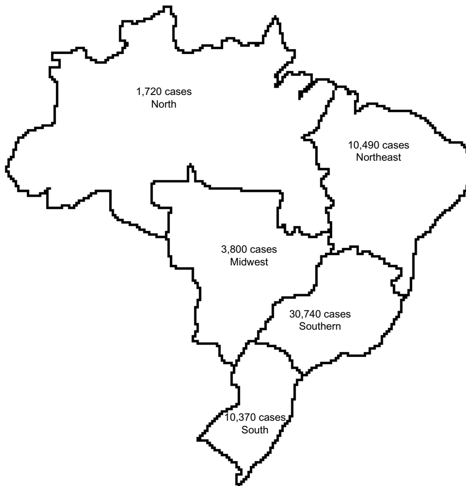
Figure 1 Representative geographic distribution of Brazilian macroregions and their respective cancer estimates for the year 2014.

Notes: The main population agglomerates are the South and Southern Regions. Data were obtained from the Instituto Nacional de Câncer (INCA) (2014). 23