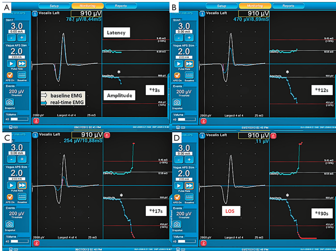
Figure 1 Example of EMG degrades to LOS from initial satisfactory baseline EMG after a left RLN traction injury during continuous IONM in thyroid surgery. The latency and amplitude waveforms were displayed separately, and an upper limit threshold for latency (+10%) and a lower limit threshold for amplitude (50%) were depicted as separate alarm lines. (A) That 3 s after the EMG signals started to show a progressive decrease in amplitude from the baseline EMG (star sign); (B) by 12 s after the start of EMG change, the EMG amplitude showed a nearly 50% decrease, but the EMG latency did not show a significant change; (C) by 17 s, the amplitude and latency crossed the limit threshold (-50% and +10%), and an alarm was displayed on the monitor screen (red bell sign) with acoustic alert; (D) from 20 to 30 s, the EMG waveform completely disappeared and the LOS occurred. EMG, electromyography; LOS, loss of signal; RLN, recurrent laryngeal nerve; IONM; intraoperative neuromonitoring.

fixed vocal cord, and a two-stage thyroidectomy has been recommended in patients with planned bilateral thyroid operation to avoid the disaster of bilateral vocal cord palsy in some studies (3,7). However, LOS may be false owing to several potential factors, such as monitor dysfunction, malposition of endotracheal tube (ETT) electrodes, misuse of neuromuscular blocking agents (NMBAs), etc., and may lead to unnecessary 2 nd operation. A reliable modality for intraoperative LOS evaluation and management would afford the surgeon real-time information that could help guide surgical procedure and planning, especially in the patient with a planned bilateral thyroid operation.