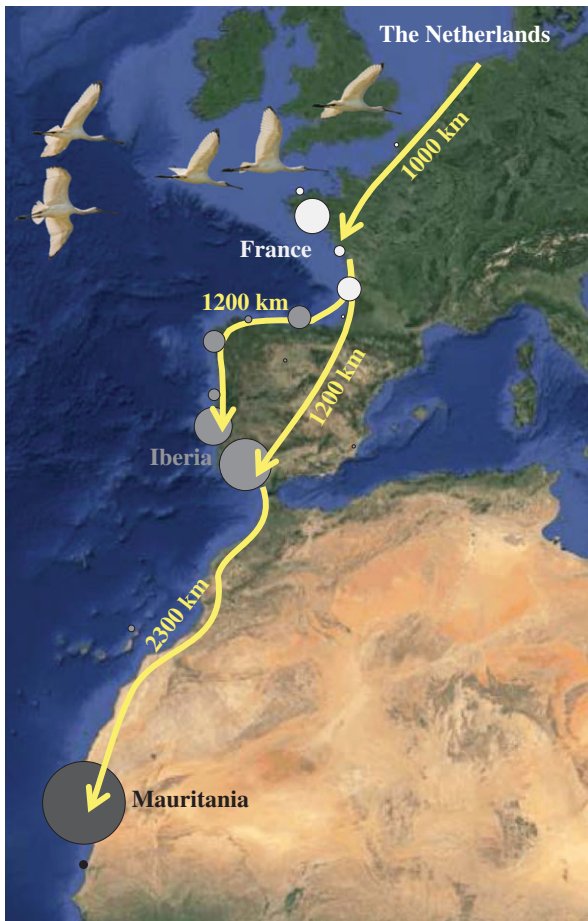
Figure 1. Map of spoonbill migration system. The sizes of the dots represent the number of individuals in the analysis that wintered at each site. (Online version in colour.)

mortality rates. This paucity of studies is easily explained by the difficulty of following individual birds throughout their annual cycle. Although some studies compared annual survival of individuals or populations with varying migration distances [11,12], estimating annual survival is not appropriate for measuring the cost of migration; the mortality cost of migration may be outweighed by the survival benefits of wintering further away from the breeding grounds [13]. For a proper assessment of the mortality cost of migration, we need to compare mortality during migratory and stationary periods of individuals with varying migration distances, while keeping constant as many other variables as possible.