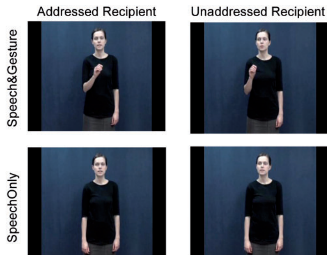
Fig. 2 Example of stills from the four types of video stimuli used.

One of our aims was to avoid confounding the visual angle of the gestures in the addressed and unaddressed conditions with recipient status signaled through eye gaze direction. Thus, rather than showing the same gestures recorded from a lateral and a frontal visual angle, the confederate speaker repeated each stimulus sentence, including the