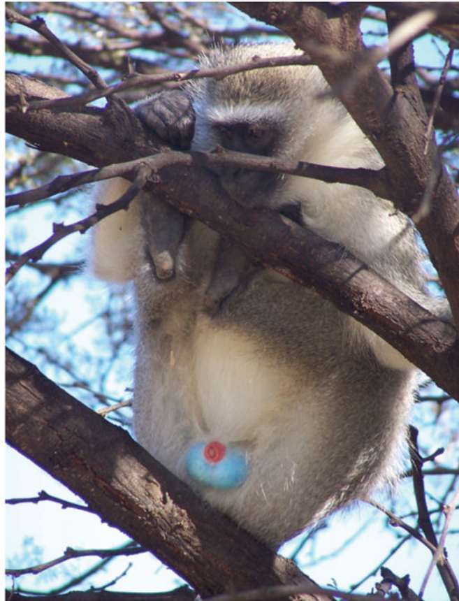
Figure 1. An adult male vervet monkey, Chlorocebus aethiops pygerythrus , from South Africa.