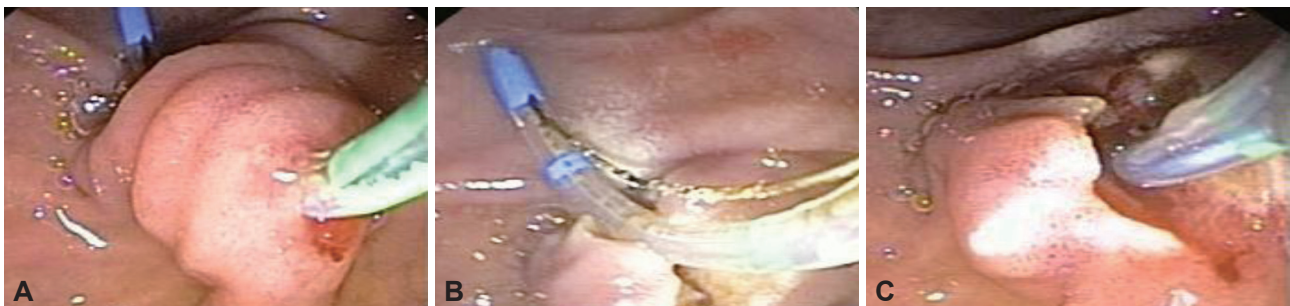
Fig. 1. (A) Formation of false tract. (B) Incision of false tract. (C) Selective biliary cannulation.

Third, as opposed to a hydrophilic guide wire used by Bur-