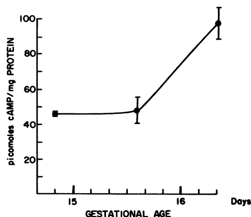
FIG. 1. Levels of cAMP present in palatal shelves at various times during development. Values are the mean of four determinations \pm SEM. Each determination represents six palatal shelves pooled from three littermates at the gestational age indicated. Gestational age is given in days and hours between day 14 (+16 hr) and day 16 (+8 hr). Midnight preceding a positive vaginal smear was taken as zero hour.

The synthesis of DNA or glycoproteins by the palates in vitro was determined by following the incorporation into palatal shelves of labeled precursors which were added to the culture medium for specified times. [ 3 H]Thymidine (57.2 Ci/mmol), [ 3 H]glucosamine (7.3 Ci/mmol) and [ 3 H]fucose