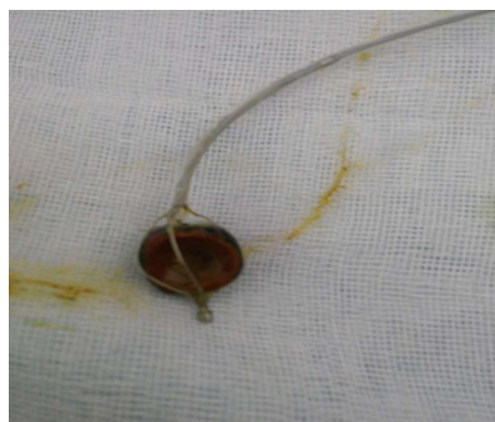
Figure 5 Removal of the entrapped basket and stone complex through a longitudinal choledochotomy incision.

study, we didn't perform any Statistical evaluation.