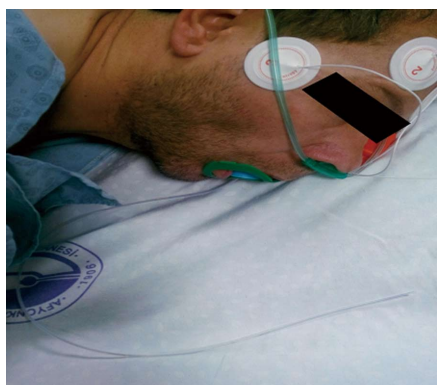
Figure 4 Following a failed removal of a stone, the transfer of the patient to the operating room while the cut edge of basket handle emerging from the mouth immediately after the procedure.