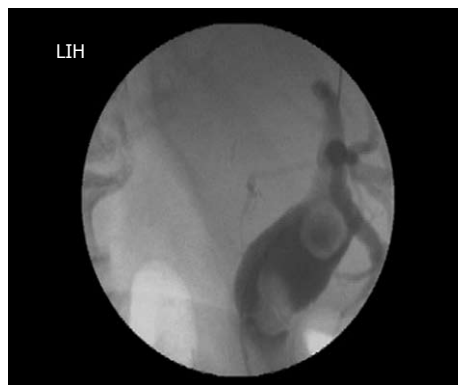
Figure 1 Cholangiography demonstrating the two giant sharp edged stones.

Endoscopic procedures and ensuing surgical procedures were performed by one of the three consultant surgeons themselves (SY, TO, YA). Following the demonstration and cannulation of the papilla, a cholangiography was obtained revealing the huge stone(s) (Figure 1). First conventional basket was tried to remove the stone from papilla (Figure 2). If it was unsuccessful and the stone could be separated from basket than basket was removed and mechanical lithotripter was placed to crush the stone(s). In both instances if the basket