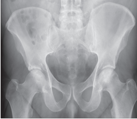
FIGURE 2: Anterior-posterior hip X-rays in patient number 3 after 9 years on Coumadin are unchanged, Ficat stage II.