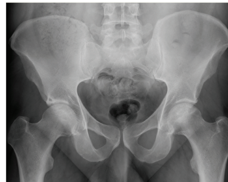
FIGURE 1: Anterior-posterior hip X-rays in patient number 3 at preanticoagulation study entry: both hips are Ficat stage II.

Both hips in patient number 5, the right hip in patient number 6, and the right hip in patient number 2 became asymptomatic in 3 months (Table 1). Both hips in patient number 1 became asymptomatic in 9 months. In patient