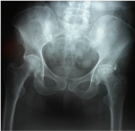
FIGURE 3: Anterior-posterior hip X-rays in patient number 4 at preanticoagulation study entry. The right hip is Ficat stage II and the left hip is Ficat stage III.