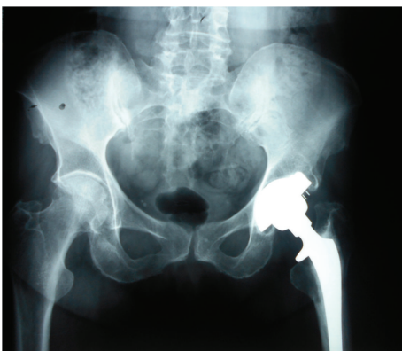
FIGURE 4: Anterior-posterior hip X-rays in patient number 4 after 5 years on Coumadin. The right hip is unchanged, Ficat stage II. The left hip, Ficat stage III at preanticoagulation study entry, was replaced before study entry.