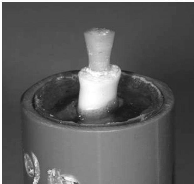
FIGURE 1- Specimen after post cementation and coronal reconstruction

placed with a lentulo spiral drill into the canal. Finally, the main post was inserted in the canal followed by four accessory posts and light-cured for 40 s through the fiber posts. Once the posts were placed, the coronal portion was reconstructed with composite resin (Filtek Z-250; 3M/ESPE), using a cylindrical stainless steel mold, in such a way to allow the performance of the pull-out test (Figure 1). Tooth surface was neither etched nor treated with adhesive, before