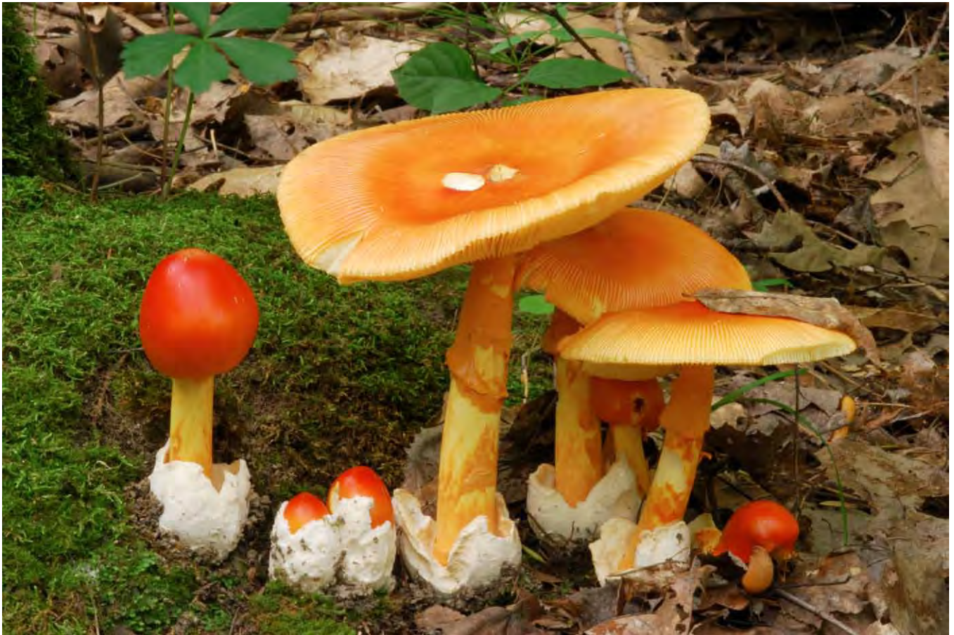
Fig. 1. Amanita jacksonii from a population in the province of Québec (Canada).

other Amanita genomes have been recently sequenced, A. brunnescens , A. polypyramis , and A. inopinata , with the aim of assessing the dynamics of transposable elements in EM and asymbiotic species within the genus (Hess et al. 2014). Amanita muscaria has also been used as a model for understanding the biosynthetic pathways of betalain pigments, which are commercially used to dye food and shown to have antioxidant properties (Hinz et al. 1997, Strack et al. 2003).