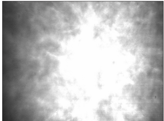
Figure 2. Multifocal hyperreflective areas with irregular borders and scattered inflammatory cells. A couple of high contrast elongated structures measuring about 3 μm in diameter are noted adjacent to the hyperreflective areas.