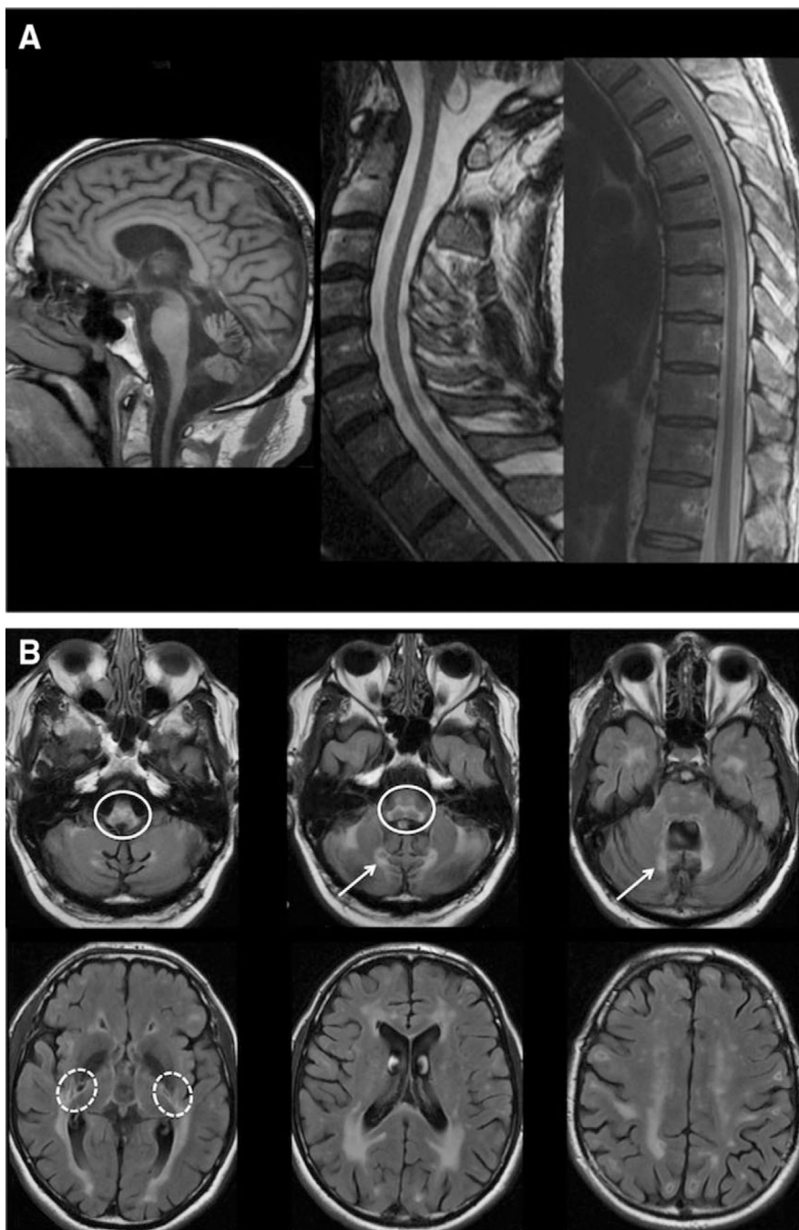
Figure 2. Typical cerebral and spinal pattern is shown in adult polyglucosan body disease patients. (A) T1 sagittal scans show important medullary and spinal atrophy and mild vermian atrophy. (B) Fluid attenuated inversion recovery axial scans show hyperintense white matter abnormalities in the periventricular regions, with occipital predominance, the external capsule and the posterior limb of the internal capsule ( dashed circles ), the medial edges of the inferior and middle cerebellar peduncles ( arrows ), and the pyramidal tracts and medial lemniscus of the medulla and pons ( plain circles ).