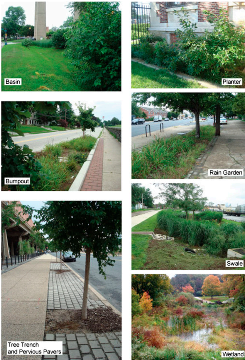
Note. Infiltration and storage trenches (not pictured) are belowground and are often colocated with other features.