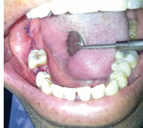
FIGURE 2: Intraoperative view after extraction of the mandibular right second premolar and debridement of the mandibular right third molar socket.

The patient, still under antibiotic treatment (metronidazole, vancomycin, and cefotaxime), exhibiting a slight improvement in walking and presenting no sign of headache nor vomiting, was permitted to be discharged on the ninth postoperative day and to continue the dental care, although it was not ended yet as mentioned in the treatment plan, by his general practitioner. Four days later, he was readmitted to the neurosurgery service owing to the new onset of walking disorders and severe headaches. Moreover, the patient complained of right arm and leg weakness. A new cerebral scan was ordered and it showed recurrence of the cerebellar abscesses that compressed the brain stem and the fourth ventricle with a sign of an active biventricular hydrocephalus (Figures 3(a) and 3(b)).