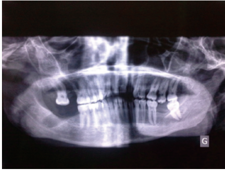
FIGURE 1: Preoperative panoramic radiograph.

abscess. Given this information, the infectious diseases service was consulted to determine the most appropriate antibiotic treatment to begin. With that service's recommendation, the patient was started on metronidazole 500 mg intravenously every 8 hours, vancomycin 500 mg IV every 6 hours, and cefotaxime 2 g IV every 4 hours.