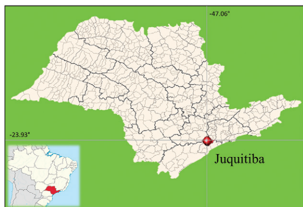
Fig. 1: location of the municipality of Jquitiba. The small map on the left shows the location of the state of São Paulo, Brazil.

Study area and population - Jquitiba is located 71 km from the capital of SP (Fig. 1) in the Atlantic Forest biome, at an altitude of 685 m. Approximately 67% of its length is covered by bushland and the preserved native forest promotes great movement of individuals due to ecotourism. Jquitiba has a population of 28,737 inhabitants, of whom 49.42% are female (Brazilian Institute