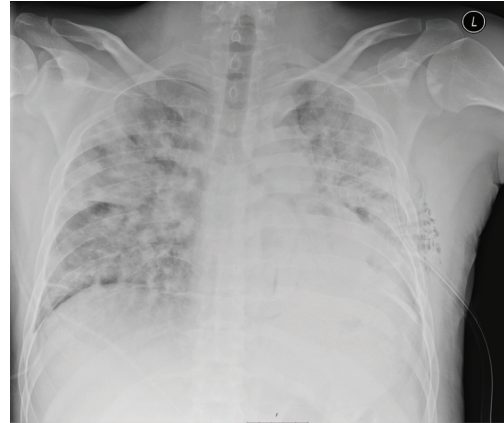
Figure 2. Chest radiograph one hour after drainage of the left hemopneumothorax showing bilateral pulmonary edema.