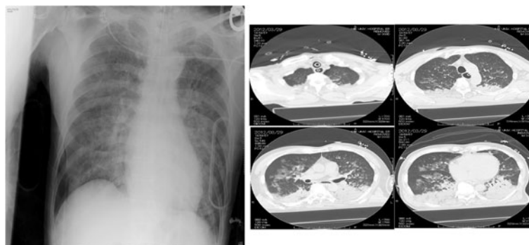
Figure 1 Chest X-ray and CT scan upon ICU admission. Chest radiograph shows diffuse infiltrate bilaterally.

cmH 2 O, and pressure support 10 cmH 2 O). The Glasgow Coma Scale score was 1-T-5, and the diameter of his pupils was 4 mm × 4 mm with light reflex of +/+. Respiratory sounds were evident as coarse crackles bilaterally. A chest X-ray showed diffuse bilateral infiltration (Figure 1). A chest CT scan revealed infiltrates bilaterally in the dependent lung regions and left multiple costal fractures with pneumothorax, probably attributable to chest compression. Arterial blood gas revealed the presence of mixed acidosis with severe hypoxia: pH 7.04, PaO 2 52 mmHg, PaCO 2 52 mmHg, HCO 3 14.1 mmol/L, BE -16.6 mmol/L, and lactate 5.4 mmol/L. The white blood cell count was slightly elevated to 12,470/μL (Table 1).