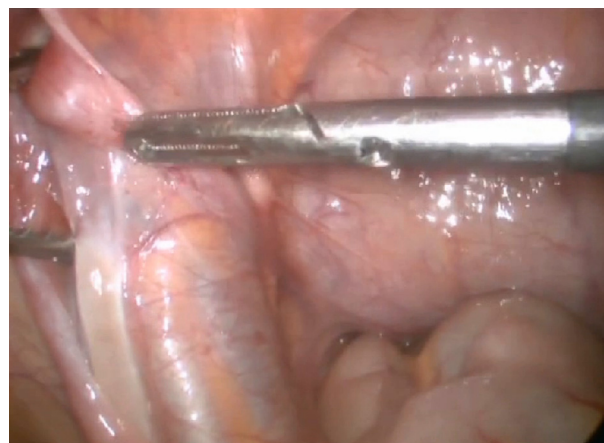
Fig. 1. Intra-abdominal testis.

Ultrasound examination revealed no left testis in the scrotum or inguinal canal, and no sign of remnants of Müllerian structures, such as the uterus, was appreciated. After counseling with the patient, his family, and pediatric psychologist, the decision was made to pronounce the patient male gendered. Subsequently, explorative laparoscopy was offered, and left testis was seen on the left internal ring. In addition, the fallopian tube and a single