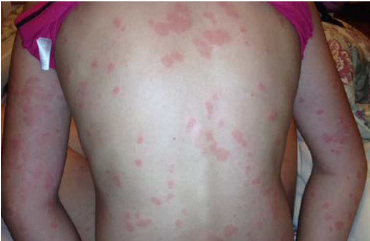
Figure 1 Chronic spontaneous urticaria.

Diagnosis of CSU is based on a thorough history and physical examination. Specific questioning about use of non-steroidal anti-inflammatory drugs (NSAIDs) is important because up to 30% to 50% of CSU patients have exacerbations associated with NSAID ingestion [1,2]. All patients require a complete physical examination, including visualization and confirmation of characteristic pruritic, raised erythematous lesions (Figure 1). Serial photographs are useful for documenting the extent and