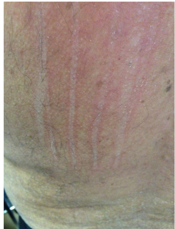
Figure 3 Dermographism.

Depending on the history, other investigations may be indicated (Table 2). A skin biopsy should be performed in patients with atypical urticaria; for example, those with burning or painful hives that persist for longer than 72 hours, suggestive of urticarial vasculitis. Patients with hyperpigmented lesions should have the skin stroked firmly to elicit Darier’s sign (whealing) suggestive of cutaneous mastocytosis and a baseline serum tryptase level to rule out mastocytosis; a lesional biopsy should be performed if indicated. Allergy skin tests generally have limited diagnostic value. The autologous serum skin test (ASST), performed by intradermal injection of autologous serum using careful sterile technique, is rarely used in practice. A positive ASST suggests the presence of auto-antibodies to the high-affinity IgE receptor or to IgE; however, this test is not specific for CSU [7]. Assays for auto-antibodies to the high-affinity IgE receptor or to IgE are only available in specialized research laboratories. Newer tests for auto-antibodies are being developed.