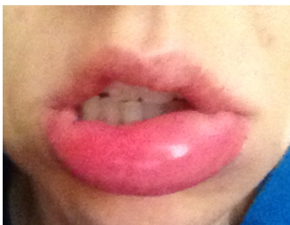
Figure 2 Angioedema.

Guidelines now recommend that the initial investigation of CSU should generally be limited to a complete blood count (CBC) and differential, and measurement of inflammation markers such as erythrocyte sedimentation rate (ESR) or C-reactive protein (CRP) [2,3] (Table 2).