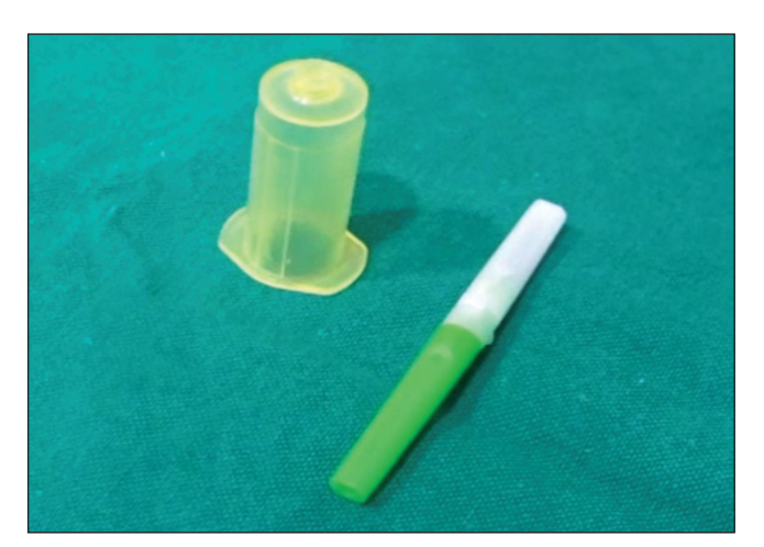
Figure 2: Venipuncture using BD Eclipse ^{\text{TM}} blood collection needle

PRP activation prior to injection is another parameter that requires further discussion. PRP can be activated exogenously by thrombin, calcium chloride or mechanical trauma. Collagen is a natural activator of PRP, thus