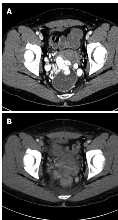
Figure 1 Computed tomography. A: Abdominopelvic computed tomography. Huge rectal varices protrude into the rectum; B: Follow-up computed tomography at 5 d after variceal embolization. Obliteration of rectal varices is identified.

The patient underwent sigmoidoscopic examination,