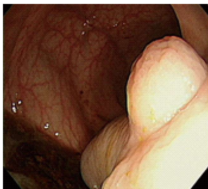
Figure 2 Sigmoidoscopic examination. Huge rectal varices protrude into the rectum, with bleeding.