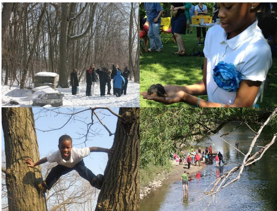
Figure 1. Children engaged in NEEP programming (pictured are not study subjects).

The Urban Ecology Center offers, for a fee, neighborhood environmental education project (NEEP) programming to schools within a 2-mile radius of each of its three Milwaukee locations. These concentrated focus areas are designed to make it possible for NEEP participants to visit the Urban Ecology Center on their own time, even with limited access to reliable transportation. NEEP participants engage in a variety of activities (see Figure 1) that are adapted for the parks adjacent to each of the three Urban Ecology Center branches.