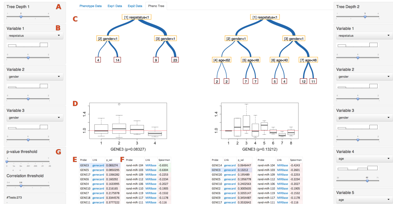
Fig. 1. Sample Screenshot of PEAX. On the left are various controls for defining sub-phenotype, including the depth of the decision tree (A), the decision variable for each node (B), and the decision variable threshold. A histogram of the sub-population of patients is shown below each decision node drop-down box. Together, these controls define the decision tree (C). A boxplot (D) shows distribution of a selected gene from a candidate list of genes (E), while a separate adjacent table (F) shows the top correlating miRNA expression levels with the selected gene. Selectable thresholds (G) allow for highlighting of significant associations in either table. Displayed data are random for illustrative purposes, due to confidentiality of clinical research work described in this paper. The entire set of controls, and resulting tree, boxplot, and associative tables, are replicated on the right side to allow for definition, viewing, and comparing of juxtaposed models.

GUI removes the requirements of being able to script and interpret R code directly, increasing the size of the audience of researchers capable of participating in the analysis process, as well as moving the clinical expert closer to the data analysis. An overview of the PEAX GUI is shown in Figure 1.