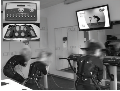
FIGURE 2: Whole-body electromyostimulation equipment.

informed about the status of the participants (WB-EMS or CG) and were not allowed to ask either.