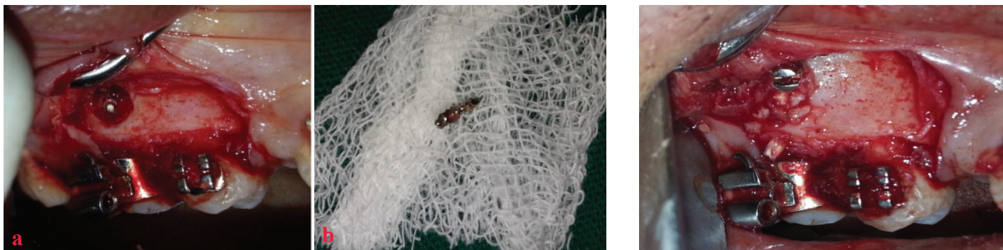
[Table/Fig-3a,b]: (a) TAD held by howe's piler