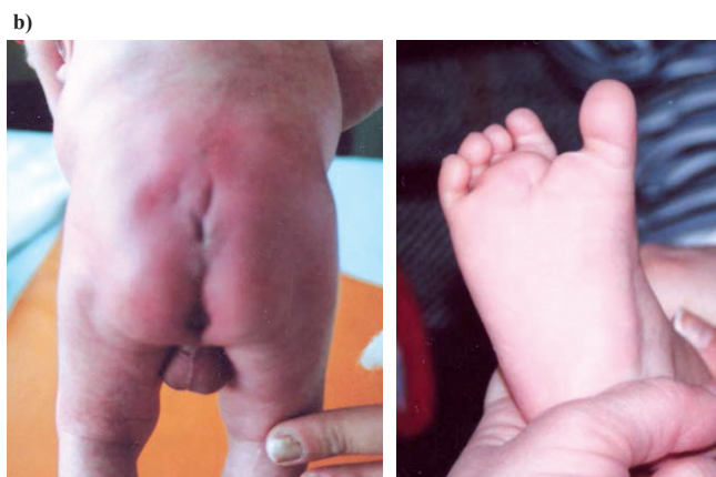
Figure 1. a) Facial appearance in our patients. b) Deep sacral dimple in patient 1; sandal gap in patient 6.

a minor atrial septal defect (ASD). Ultrasonography of the kidneys showed agenesis of the left kidney and hypoplasia of the right kidney. Serum urea and creatinine were above the upper limit. At the age of 2 years, the child had an intestinal obstruction due to a malrotation and underwent surgery. Seizures started at the age of 1.5 months, and had tonic-clonic characteristics, with severe, long-lasting outbursts frequently leading to epileptic status; therefore, antiepileptic therapy was introduced. At the age of 4 years he was not able to walk without support and had autistic behavior. Chromosome analysis revealed a cytogenetically visible deletion of the short arm of chromosome 4: 46,XY,del(4)(p15.3).