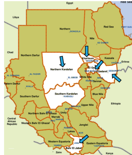
FIGURE 1: White color with arrows showing the surveyed areas in Sudan and South Sudan.

2.3. DNA Amplification. A protozoa-specific forward primer (P-SSU-342f) and Eukarya-specific reverse primer (Medlin B) targeting 18S rRNA gene were used. The forward primer was P-SSU-342f (5' CTTTCGATGGTAGTGTATTGGACT-AC-3') and the reverse primer was Medlin B (5'-TGATCC-TTCTGCAGGTTACCTAC-3'), [18, 19] in PCR to obtain