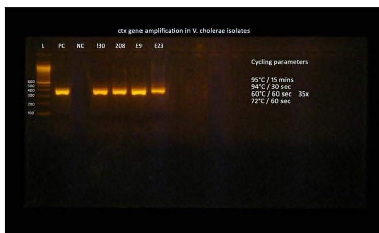
Figure 2 Amplification of ctx gene in V. cholerae isolates (L-Ladder, PC-Positive control, NC-Negative control, clinical V. cholerae isolate; 130, 208 and environmental isolates; E9 E23 showing positive ctx band).

sensitivity of 90% and 77.3% to cefotaxime and chloramphenicol respectively. However they showed that 81.8% of strains were resistant to tetracycline. Garg et al. , reported high-level resistance to chloramphenicol in India. This result contrasted to our findings [13]. Macrolide resistance was rarely reported in the studies by Harris et al. , 2012 and Kanskar et al. , 2011 [2,22], yet a high level erythromycin resistance (90.9%) was found in our study. Resistance to erythromycin and other antimicrobial agents among V. cholerae can be acquired through selected mutations over the time, or due to widespread use of antibiotics for prophylaxis in asymptomatic individuals [38].