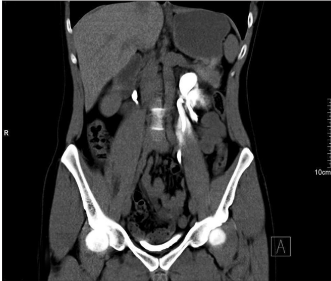
Fig. 2 Postcontrast coronal CT image shows contrast extravasation from the left upper ureter.