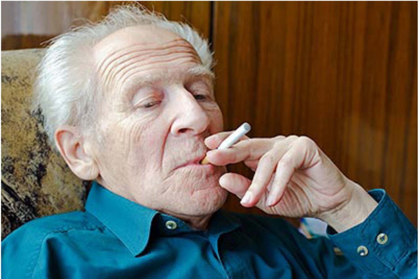
Figure 3. Could E-cigarettes Someday be Used to Combat Alzheimer's Disease?