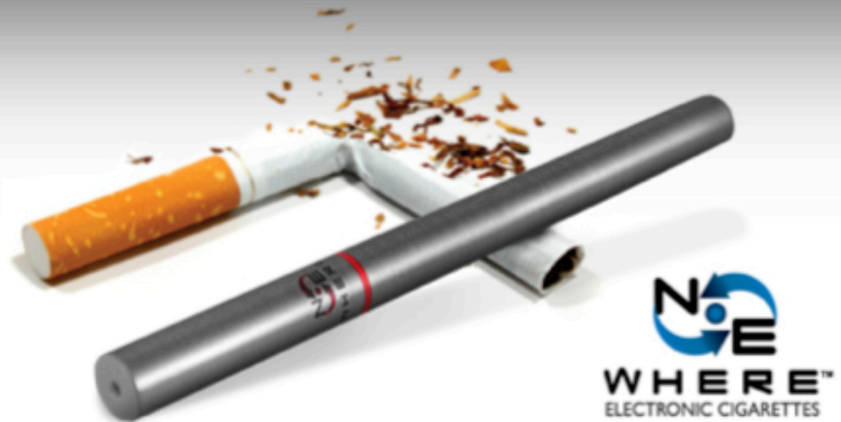
Figure 1. Electronic Cigarette Blog Promotes E-cigarettes as Smoking Cessation Devices Note.

Available at: http://newhere.com/blog/quit-smoking-electronic-cigarettes/ . Accessed May 31, 2014.