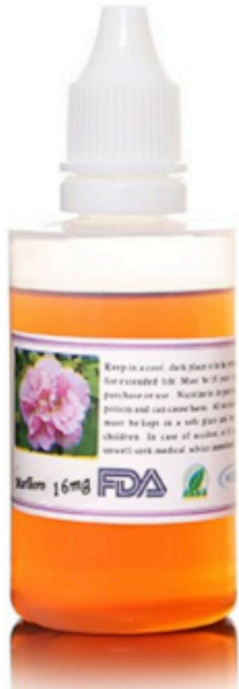
Figure 4. E-cigarette Liquid Refill Bearing the FDA Label Note.