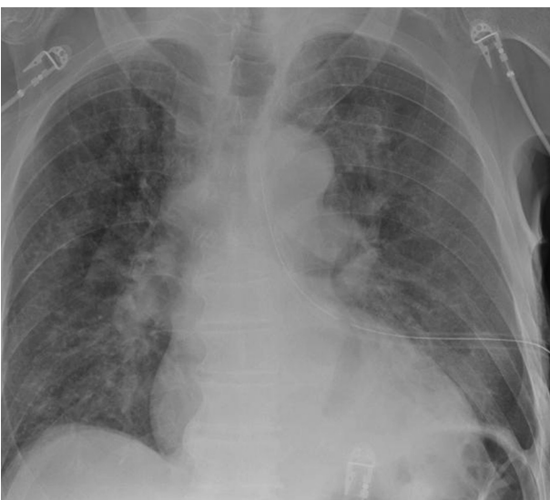
Fig. 2. Fully expanded lung after intercostal drain (ICD) insertion.

A chest X-ray may show a unilateral alveolar filling pattern within 2–4 h after reexpansion, which may progress over 48 h and persist for 4–5 days. The edema resolves in 5–7 days without remaining radiographic abnormalities [7]. The most common findings on a computed tomography (CT)-scan include ipsilateral ground-glass opacities, septal thickening, foci of consolidation, and