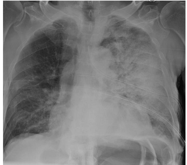
Fig. 3. Reexpansion pulmonary edema 2 h after drainage.

Carlson described the first case of pulmonary edema after pneumothorax [3].