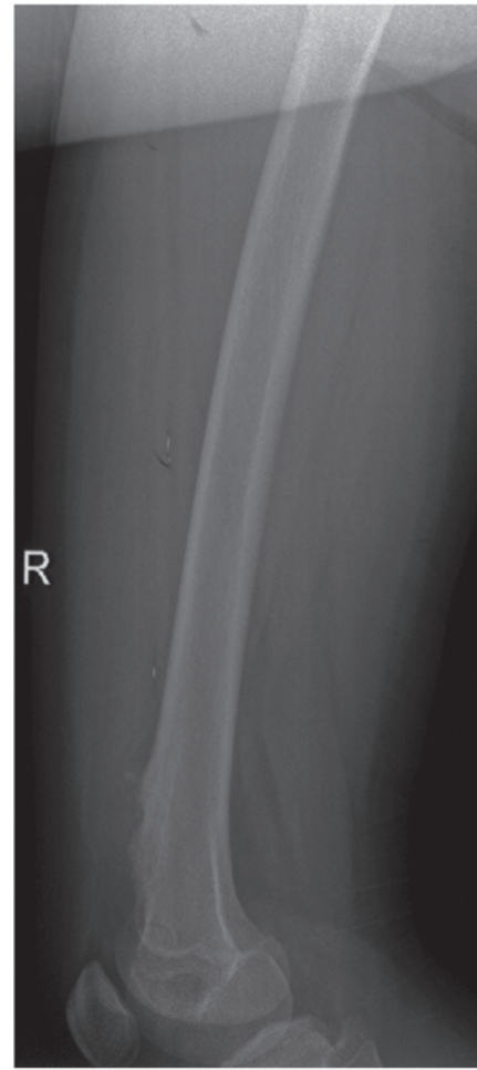
Figure 1. Radiography showed a large radiolucent shadow with stippled calcification.

M, male; F, female; PF, proximal femur; DF, distal femur; MF, middle femur; NP, not provided.