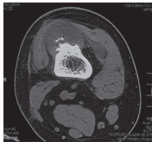
Figure 2. Computed tomography revealed a solid tumor of 5x4 cm in diameter and associated with the right distal femur bone, with abundant specks of calcification.

penetration to the medullary cavity and surrounding soft tissues was identified. A diagnosis of periosteal chondroma was therefore determined.