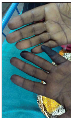
Figure 1: Dry gangrene of left little and ring finger of left hand

Invasive peripheral conventional angiography revealed stenosis in the left subclavian artery proximal to the origin of the vertebral artery and right common